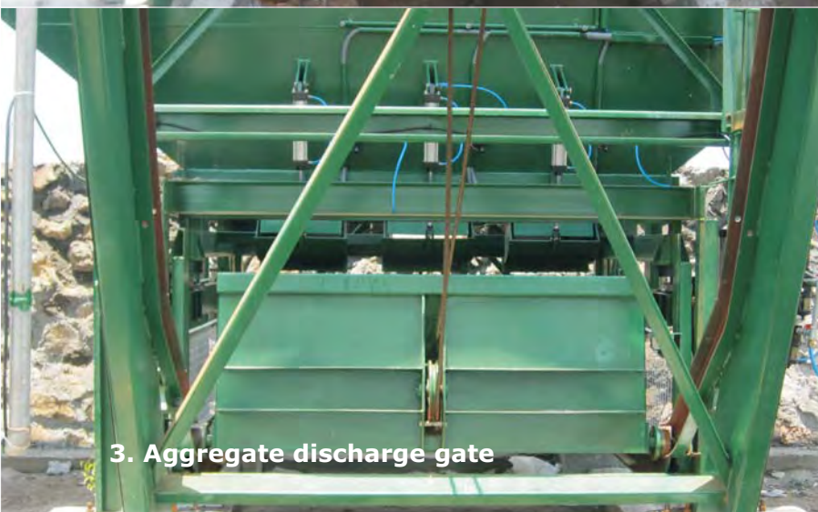
3. Aggregate discharge gate