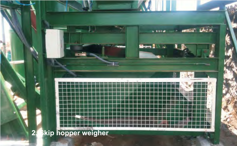
2. Skip hopper weigher