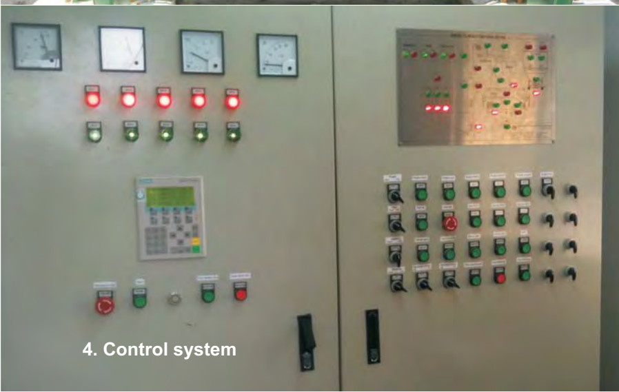
4. Control system