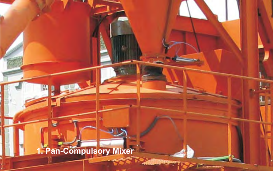
1. Pan-Compulsory Mixer