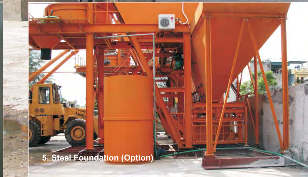
5. Steel Foundation (Option)

Pan Compulsory mixer apply for ready mix. Planetary mixer apply for precast concrete.