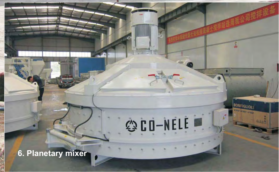
6. Planetary mixer